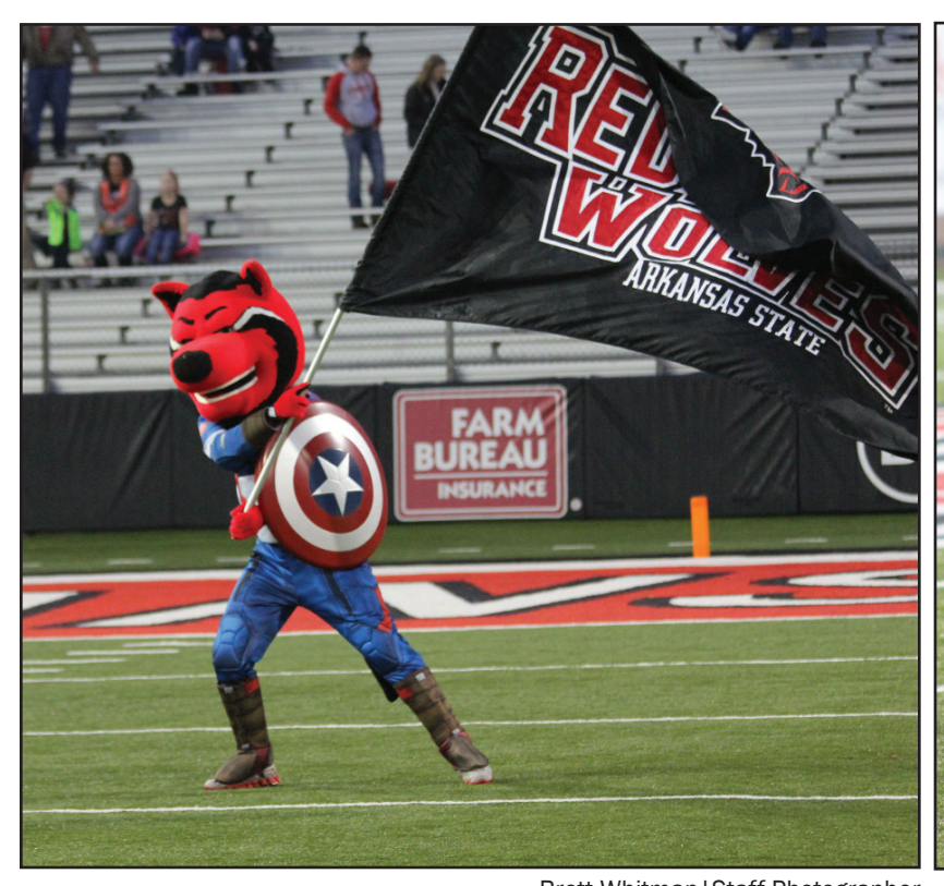
America during Saturday's game against Georgia State.

veryone in the South loves going to cheer on their favorite team on Saturday nights, but there is more going on at the games besides just football. The fans cheering them on is one of the biggest things you see on those fall nights. Most of the fans are more into the game, than even the players. They yell, celebrate, dance and even boo throughout the game. During half-time you see even more with the band marching to their most recent competition show. You see the dance team and cheerleaders performing their routines for hundreds to see, for their entertainment. There is so much to see besides just football at these games. To see more photos go to The Herald's website, astateherald.com.